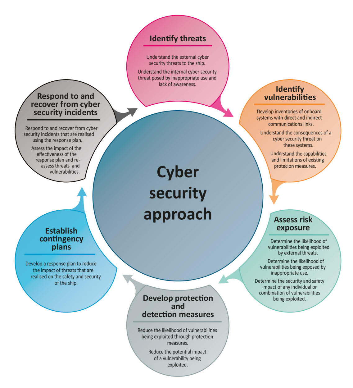
Figure 1. Cyber security approach as set out in the guidelines