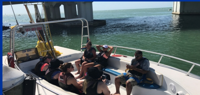
6-PACK with an extra paid passenger