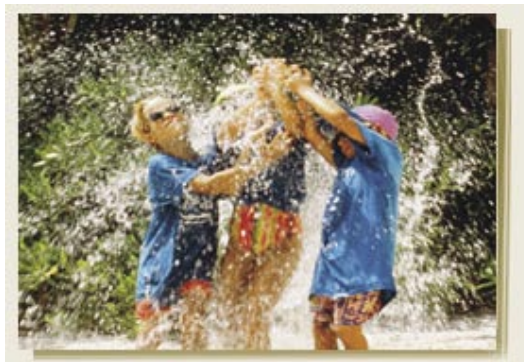
Kids' Klub - Daily & Evening Programs: (Not Sponsored by the MLA)

Guest Rooms feature balconies, room service, High speed internet access, robes, hair dyers, custom-blended vanity products, coffee maker, cable TV, On Command Videos, voice-mail, iron and ironing board, mini bar, make-up mirror, in-room safe, private balcony and spectacular views.